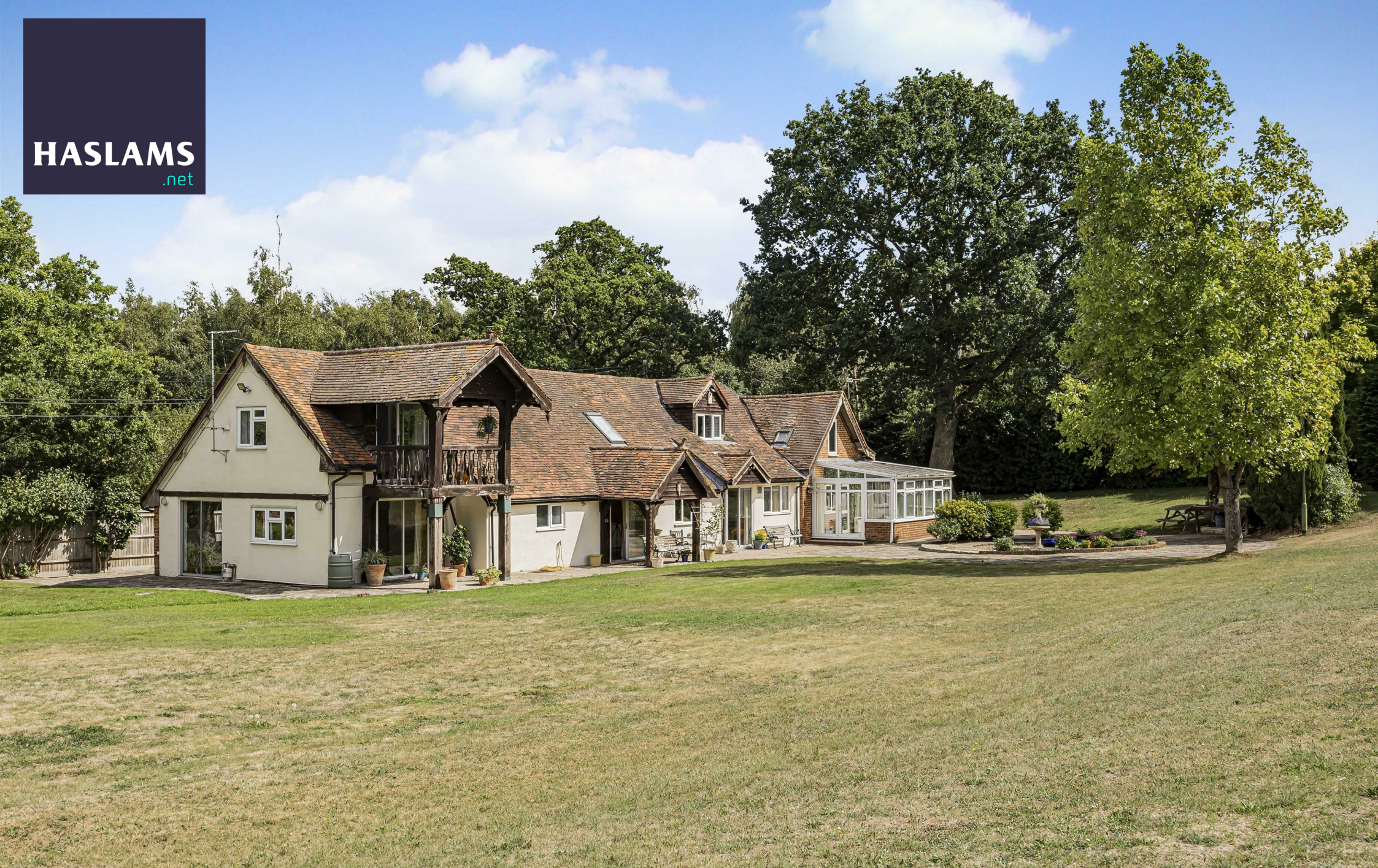
Briar Rose Cottage, Honey Hill, Wokingham, RG40 3BG